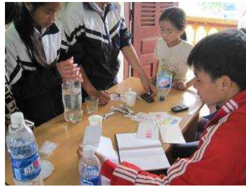
Children conducting "Pack Test"