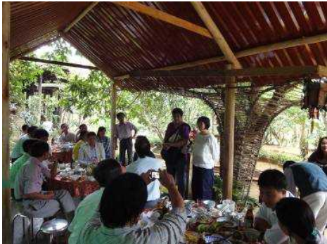
Dining after the tour

On that day, local TV network in Hue accompanied the tour. We expect that such coverage will further increase awareness of environmental issues in the region.