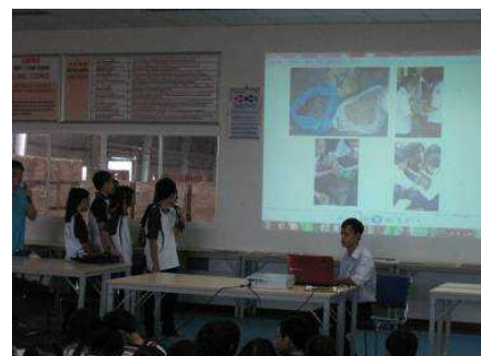
Children making presentation

On March 14, the sixth day of our visit, we held a factory tour at LIXIL INAX SAIGON Manufacturing Co., Ltd. (“LIXIL SAIGON”) which manufactures tiles by inviting 120 Ngoi Sao junior high school students in Ho Chi Minh as well as 5 BAJIKO Class children (BAJIKO Class is the name of a classroom run by BAJ for children to learn science, manual training, and environmental issues. Following the environmental class two years ago, students of Ngoi Sao have continued environmental activities voluntarily. This time, prior to the factory tour, the students made a presentation to report on their activities. Local employees of LIXIL SAIGON made