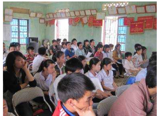
Children eagerly listening to classes

In the morning, a class was held using our original textbook “Let us think about and study water”. First, we taught basic knowledge of water, such as the fact that only a small portion of water on the earth can be used for daily life, and that water is circulating in the earth’s ecosystem. Then, we explained harmful effects of water pollution and unsanitary environment on human health, trying to make the students understand why clean water is important. We also introduced several ways to improve the situation in their daily life, including separation of garbage and composting.