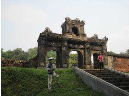
Dien Voi Re, the world heritage site we visited during the tour

brought by a flooded river. At each point, we saw local residents introducing their lifestyles and cultures proudly, realizing and conveying attractiveness of their community. We are sure that they are making progress steadily.