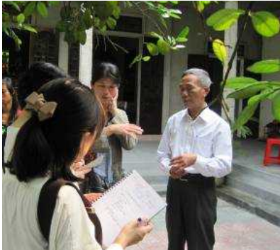
Farmer explaining how to grow Zabon

After the tour, we enjoyed the dishes using locally-produced vegetables and pork, together with the people in the community. After the dinner, LIXIL staff again explained the importance of clean water and natural environment, and all the participants agreed to it.