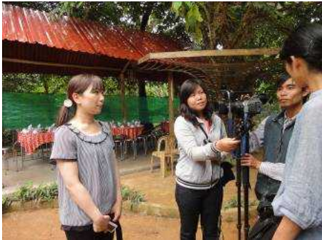
LIXIL staff interviewed by local TV