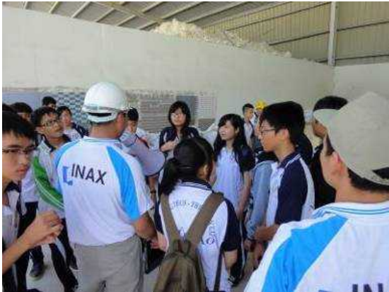
Local employees of LIXIL SAIGON explaining the manufacturing process

Through this year's activities, we strongly feel that local people including children are more aware of environmental issues than before, and that our efforts so far are bearing fruit gradually but steadily in Vietnam. We have also noticed some problems specific to each area. Going forward, we will further promote our activities based on local needs to raise environmental awareness of local people and help them act on their own. In this way, we will strive to contribute to the Vietnamese society.