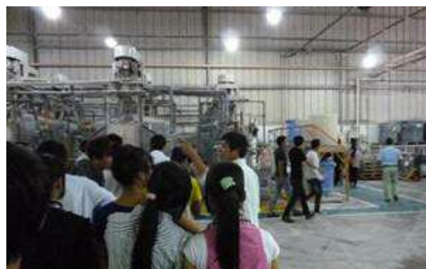
Large machinery giving full of surprises to children