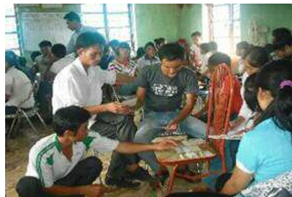
Showing great interest in changes in color