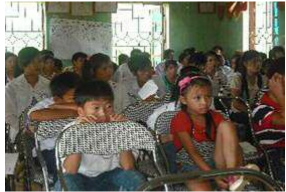
Children eagerly listening to classes

In the afternoon, samples of well water and river water that had been collected in advance by each hamlet were tested for quality using "Pack Test". In addition, transparency measurements were performed with transparency meters made of plastic bottles. The water quality tests checked water quality on a scientific basis by measuring PH levels, COD levels, and the quantity of phosphorous and