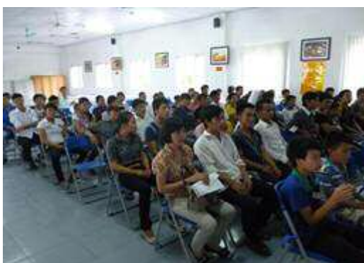
Listening to presentations

After the presentation, a tour of the LIXIL VIETNAM factory was conducted. In Vietnam, only few factories accept such tour/visit and thus, it is difficult for ordinary people to enter a factory. Therefore, the people of the village really looked forward to it. The participants were divided into 6 groups, each of which was accompanied by about 3 staff members. They observed Japanese manufacturing, while being surprised to see large machinery for the first time and making questions about operation at each process.