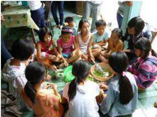
Cooking traditional food