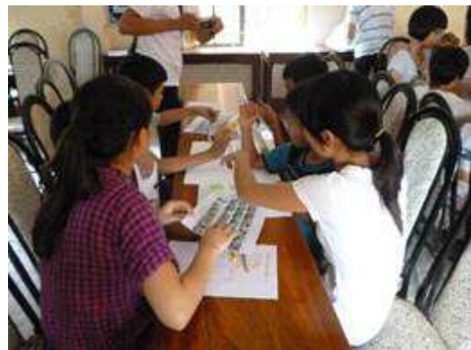
Exploring relation between photos and texts

The workshop was held at the same time in Ho Chi Minh by the BAJ staff; with an iPad, the two venues were connected real time to allow opinion exchanges. By letting the children in an urban city Ho Chi Minh and those in a rural village Hue communicating with each other, those from Ho Chi Minh have become interested in traditional lifestyle, while those from Hue have recognized the values of life and environment that remain in the region they live, which has thus enabled them