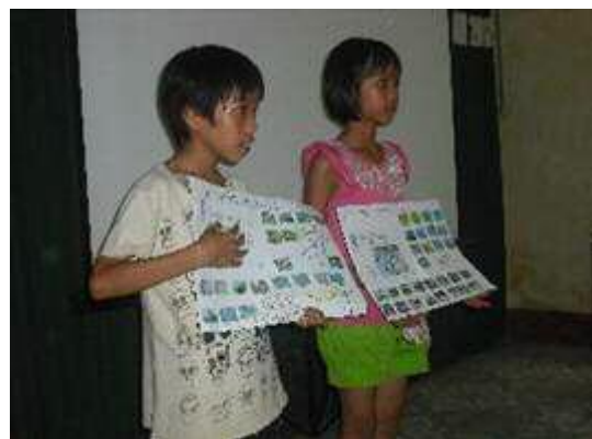
Children making presentation