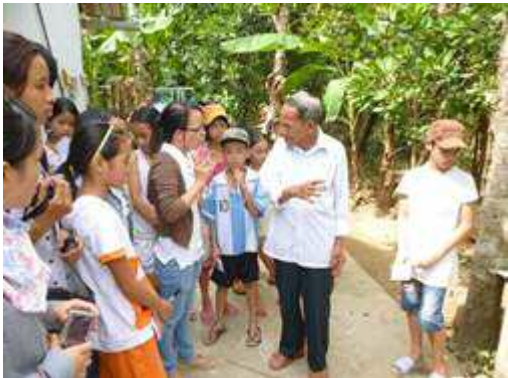
Farmer answering questions asked by children

The farm house we visited first did not use tap water to cultivate crops; instead well water was used. We learned that if tap water was used continuously, its high salt concentration hindered crops from growing. In addition, the farmer collected rainwater in a tank for washing purposes. In Hue, most farmers use rainwater as daily life water. This is how we learn the way to make best use of limited water.