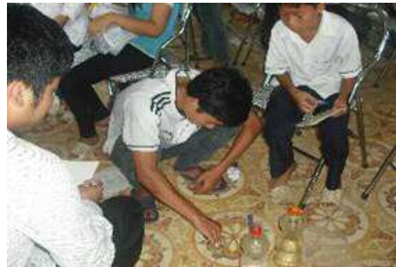
Measuring water prepared by each hamlet