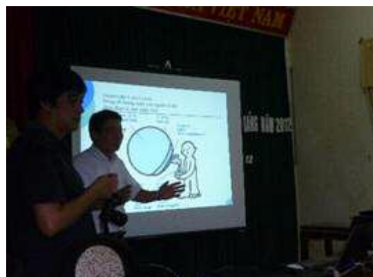
Class after workshop