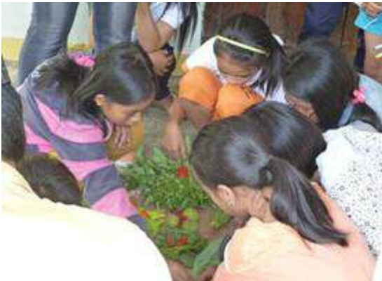
Packaging vegetables delivered to Ho Chi Minh

In the farm house we visited next, we saw an organic field and tasted harvested vegetables. Then, we cooked traditional food using the vegetables. Next, environmental classes featuring water were held using texts of Kamishibai-size (size of paper used for picture-story show). After visiting the farm houses that devised a way to use water, the children seemed to have actually realized and understood the importance of water by learning that water is limited, precious resource.